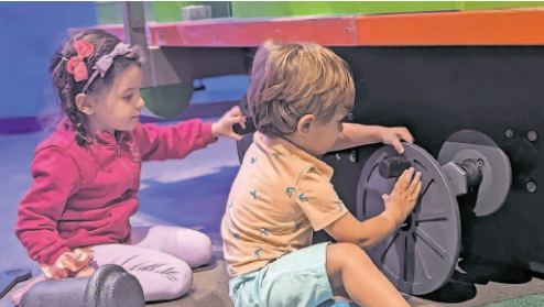
Visitors collaborate to repair Percy's wobbly wheels.