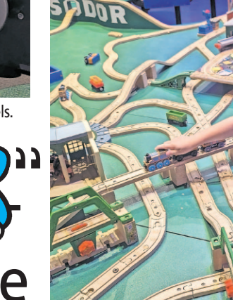
Explore the Island of Sodor for an adventure on